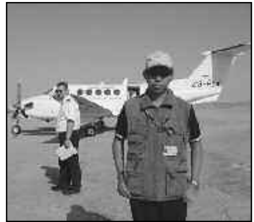
A Nepalese Gurkha guard patrols a private airstrip near Bagram Air Force Base.