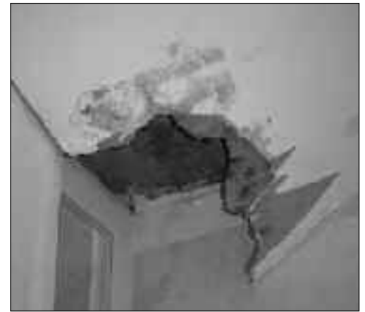
Rotten ceiling in the new Qalai Qazi clinic.