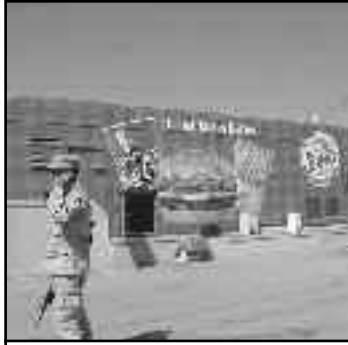
Western brands insulate contractors from local culture.

I spent nearly six months in a house rented by BearingPoint, the American contractor USAID hired to revamp Afghanistan's economic infrastructure for an initial $98 million from 2002 to 2005 and then boosted by another $46 million for the next three years. BearingPoint is the management consulting company that split off from KPMG Peat Marwick following the accounting scandals of the early 2000s. A significant portion of its consultants are former employees of Arthur Andersen, another accounting firm that split up and renamed itself in the wake of a scandal. 130