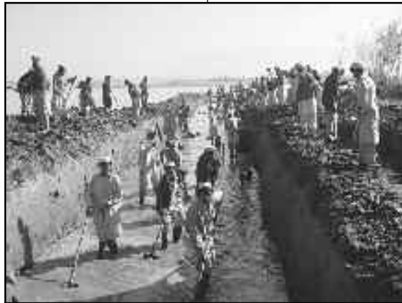
Former poppy growers clean a canal near Jalalabad as part of an alternative livelihoods program funded by USAID.

The project is perhaps the largest feather in The Louis Berger Group's cap. Already, Berger had successfully managed Afghanistan's currency transition, which was meant to strengthen and stabilize the Afghani to make foreign investment in the nation easier. Before the switch-over, it was 40,000 Afghans to the U.S. dollar. Today it is 50-to-one. The new notes also got a facelift, and resemble the United Arab