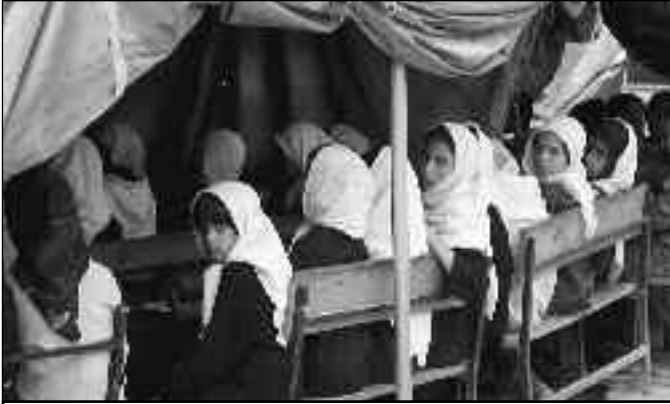
Girls in a makeshift school in Kabul.