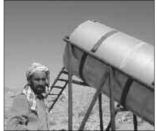
Grain silos built for farmers go unused in Parwan province.