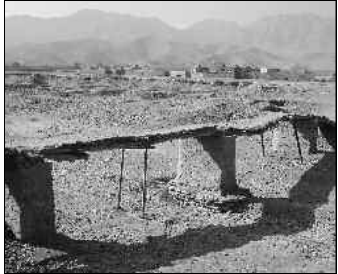
Kabul River Bridge near Pakistan.

Where did the money go? Between USAID at the top and ARC Construction at the bottom, most of the money was siphoned off for “overhead” and profits. Louis Berger reports that $4 million alone was spent on setting up and moving the mobile camp that housed employees, and on importing construction equipment from Turkey. Another $1.6 million has gone to the salaries of 12 Afghan and three international inspectors. Monthly pay is about $90 for the hundreds of laborers and up to $5,000 for engineers and supervisors