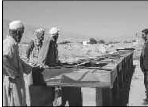
Farmers examine a useless produce dryer provided by international agriculture consultants.

One project that flew under the radar involved building irrigation canals for farmers in Helmand province. A little advanced research might have exposed the fact that the farmers in the region are overwhelmingly opium poppy growers and that they were using the water to grow even more poppies. The success of one of Chemonics’ contracts was openly undermining another: to wean farmers off the opium market. 129