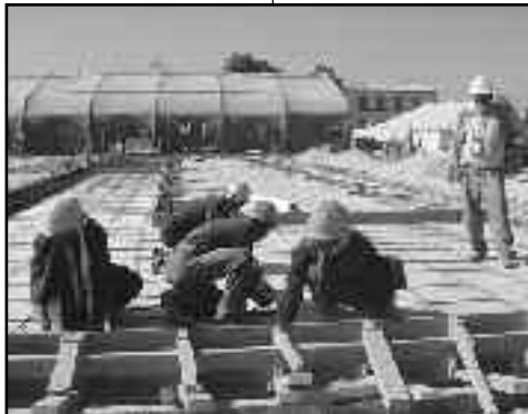
Kellogg Brown & Root employs Afghan laborers to build structures at Bagram Air Base.

While there is a minimal level of transparency and accountability to USAID’s processes, the Pentagon, which is trying to win hearts and minds through reconstruction in Afghanistan, provides almost no public access to how its funds are spent (for reasons, usually, of “national security”). The Pentagon has hired hundreds of American contractors to work in Afghanistan, in effect privatizing military and diplomatic