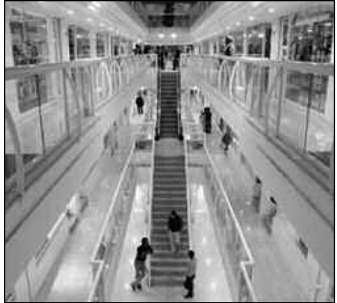
The Kabul City Center Mall.

The United States' own inventories have acknowledged that efforts so far have fallen short of nearly every goal. The Government Accountability Office report presented to Congress in 2005 states that, although improvements to basic infrastructure have been made in Afghanistan, security and other obstacles have held back many of the reconstruction goals that USAID set forth four years ago, under which it doles out and oversees billions of dollars in reconstruction and aid contracts. The Afghanistan Freedom Support Act of 2002 was Congress' attempt "to create national security institutions, provide humanitarian and reconstruction assistance, and reinforce the primacy of the central government over Afghanistan's provinces." 12 But four years later, after the American-led invasion ousted the Taliban and the Western-