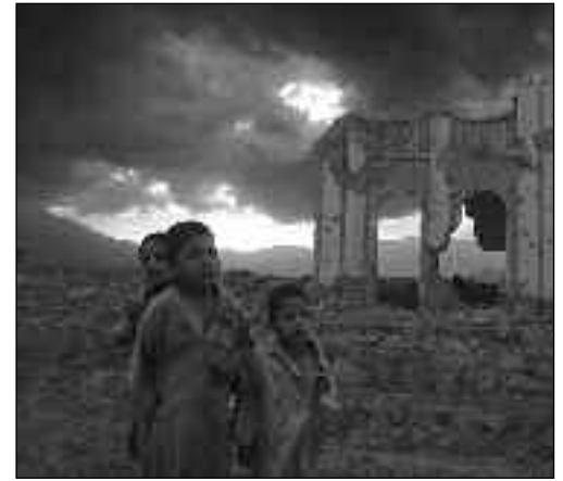
Boys in front of a bombed-out mosque near Kabul.