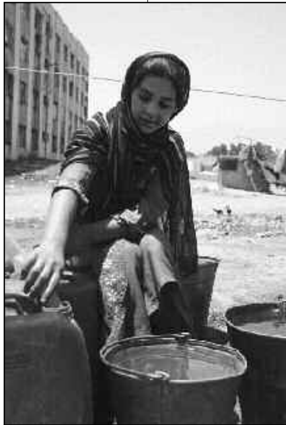
A girl fetches water from a public well in Kabul.

and fueling a Taliban-led insurgency that continues to gain power. The basic infrastructure in the country is in shambles; the drug trade is booming. This result should be seen as a major setback to the "War on Terror." To Afghans, who after decades of war, believed they would finally catch a break, it's a heartbreak.