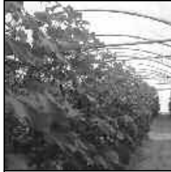
A working greenhouse used by a single farmer.

an illegal but lucrative native crop—the poppy, the local variety of which contains opium that can be altered to produce heroin. Poppies need very little water or fertilizers to thrive. That’s where the drug war and the War on Terror converge. The United States government awarded Chemonics an additional contract worth $120 million over four years to train opium growers in alternative skills, as part of the United States’ and United Nations’s ongoing efforts to eradicate opium cultivation and squeeze off the heroin trade in Central Asia. 118 Some opium growers were redeployed as manual laborers, helping to construct concrete canals.