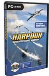
Harpoon 3: Advanced Naval Warfare

Wargames at Discount Prices Featured Game