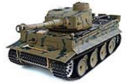
Airsoft RC German Tiger I Electric Tank .