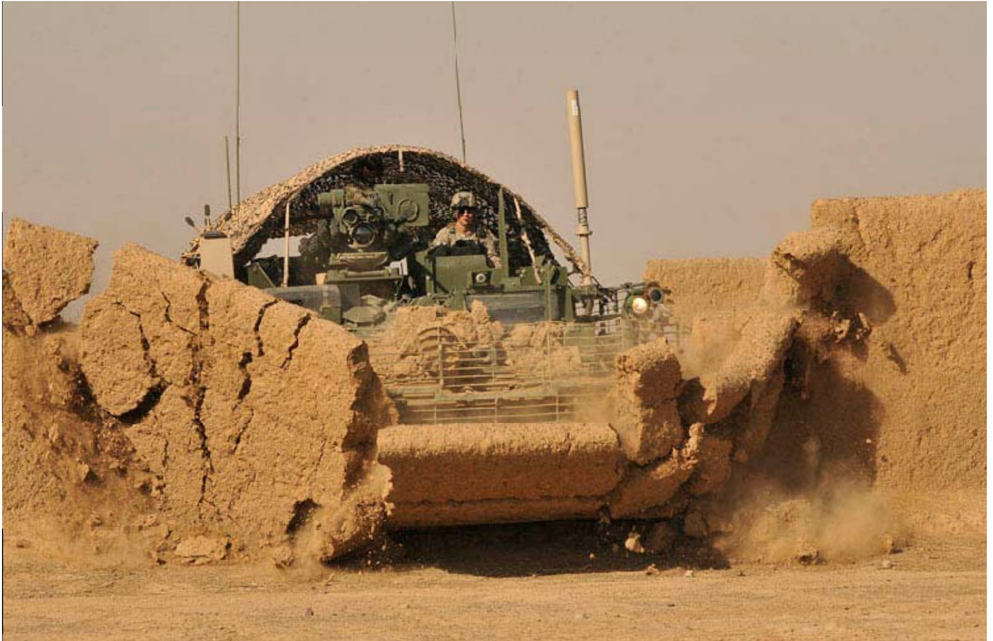
U.S. Soldiers with Mobile Gun System platoon, 2nd Battalion, 1st Infantry Regiment, 5th Stryker Brigade Combat Team, 2nd Infantry Division destroy an abandoned compound near Highway 1, Hotal, Afghanistan, Feb. 18, 2010. Recent discoveries of explosive devices have forced U.S. forces to destroy compounds in the area. (100218-F-0692M-075)