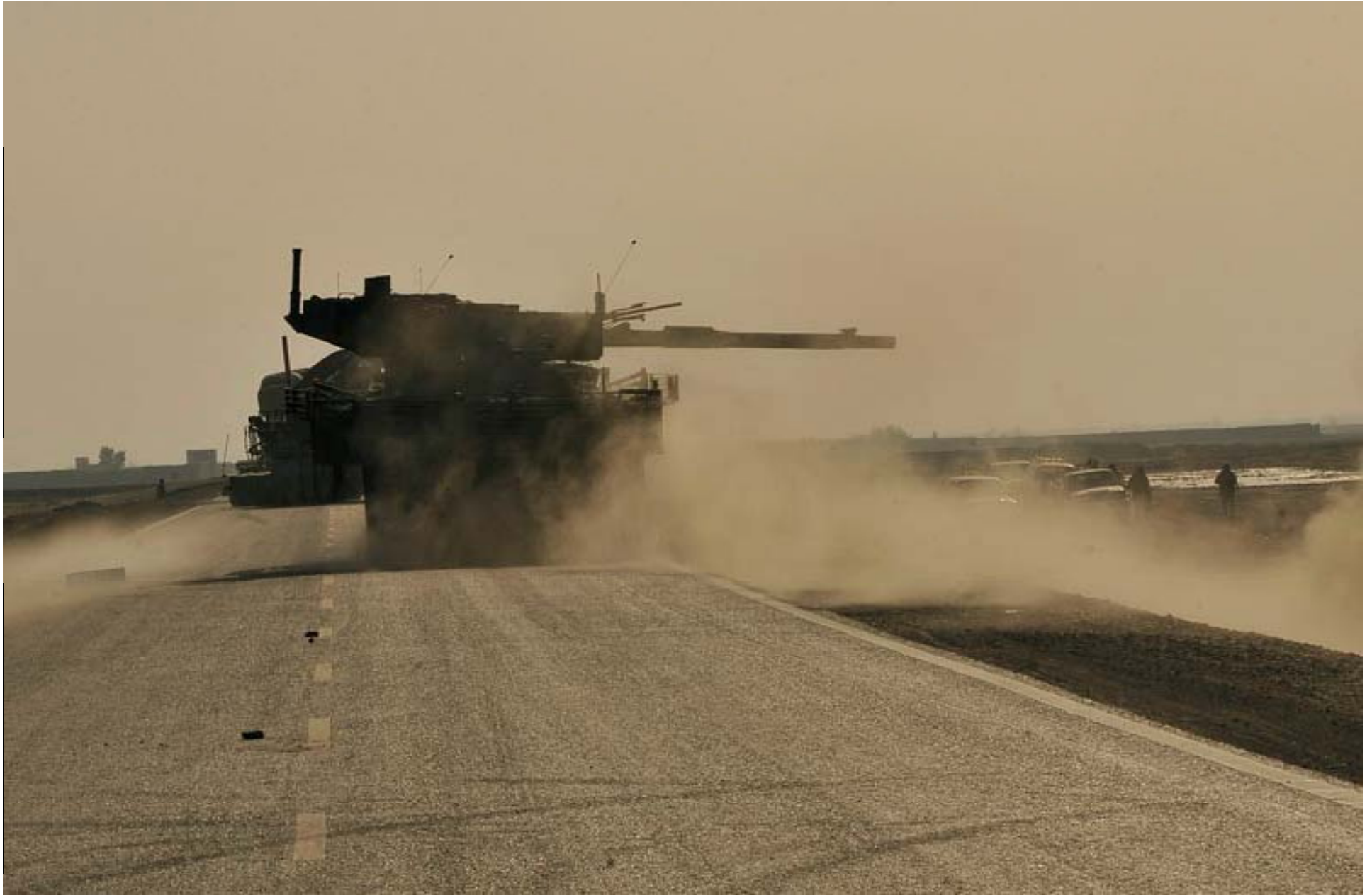
U.S. Soldiers with Mobile Gun System platoon, 2nd Battalion, 1st Infantry Regiment, 5th Stryker Brigade Combat Team, 2nd Infantry Division destroy an abandoned compound near Highway 1, Hotal, Afghanistan, Feb. 18, 2010. Recent discoveries of explosive devices have forced U.S. forces to destroy compounds in the area. (100218-F-0692M-018)