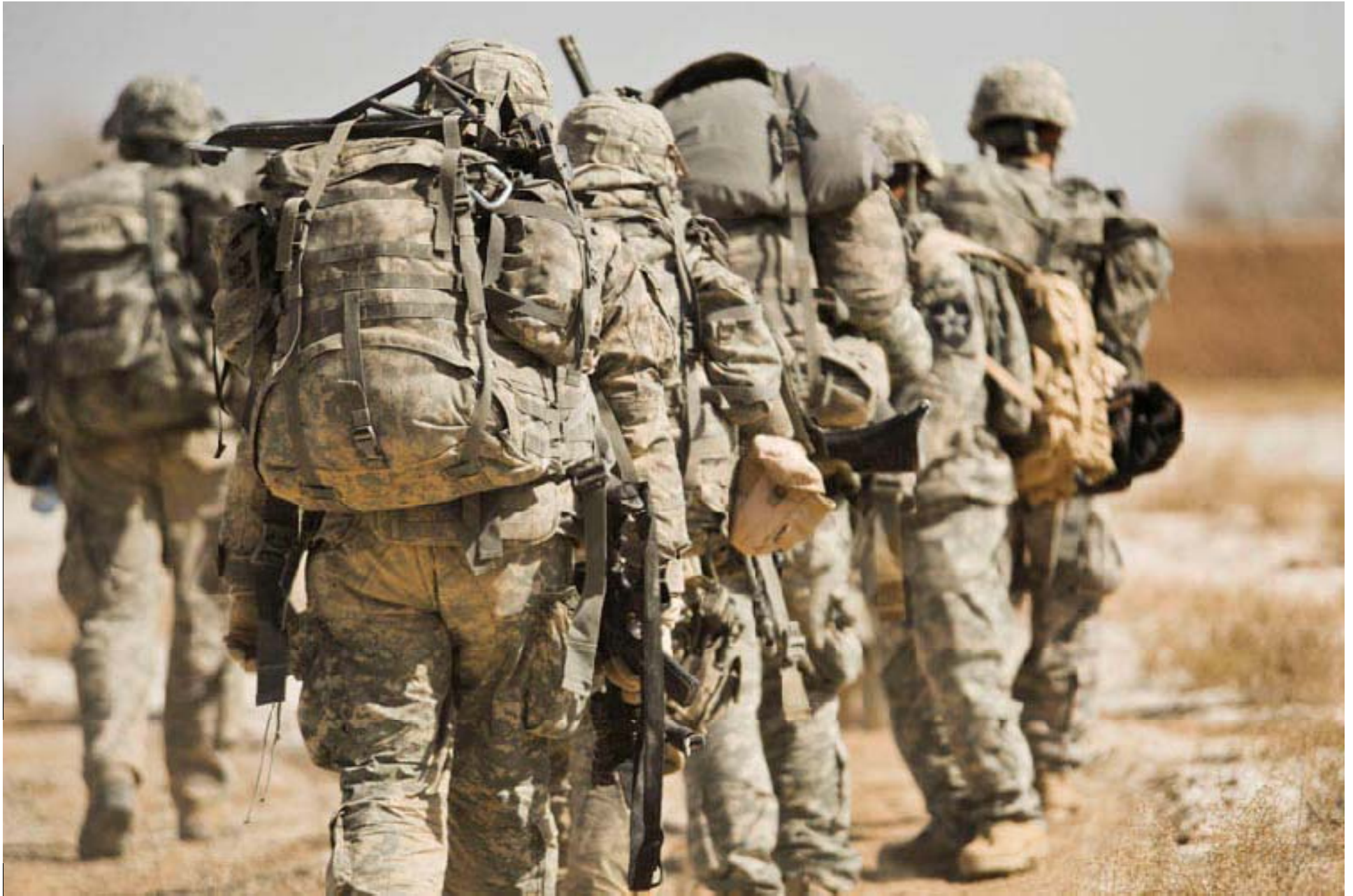
U.S. Soldiers with Alpha Company, 1st Battalion, 17th Infantry Regiment return to camp after conducting a dismounted patrol during Operation Helmand Spider in Badula Qulp, Helmand province, Afghanistan, Feb. 17, 2010. (100217-F-9171L-651)