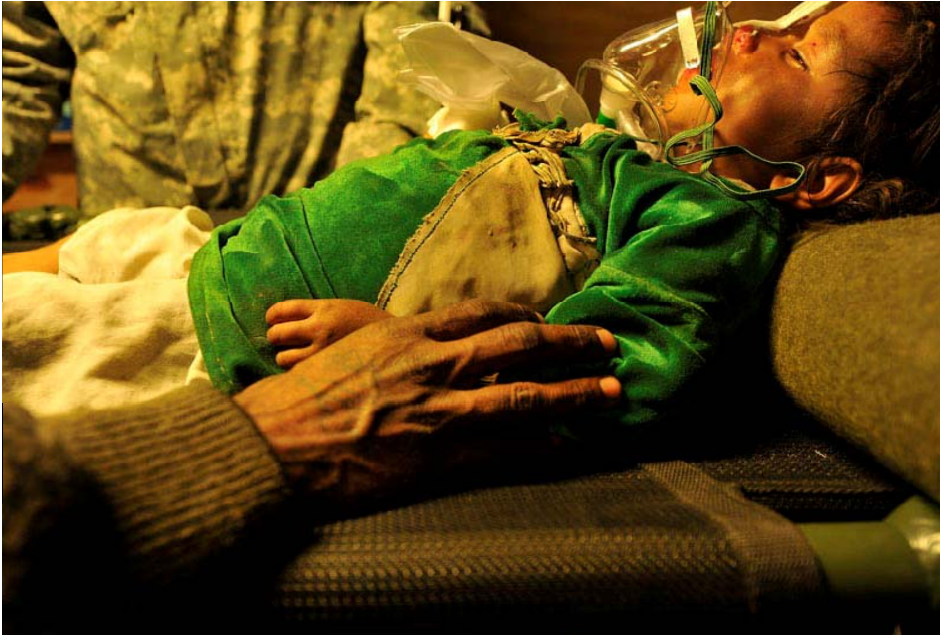
An Afghan girl receives medical treatment at the trauma aid station, Combat Outpost Rath, Afghanistan, Feb. 18, 2010. She was recently involved in an accident resulting in burns to the right side of her face and hand. (100218-F-0692M-181)