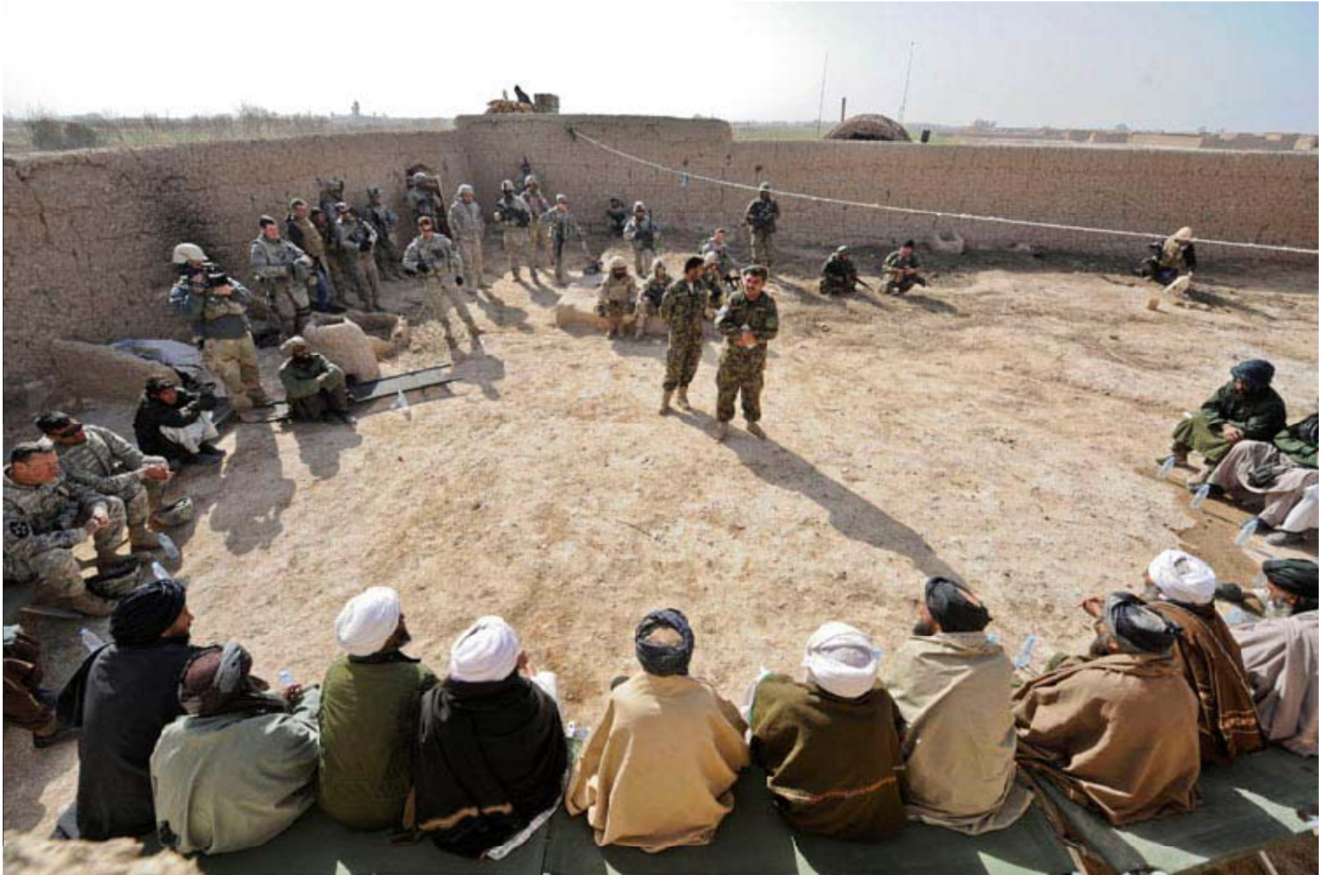
Afghan National Army soldiers conduct a town meeting with village elders during Operation Helmand Spider in Badula Qulp, Helmand province, Afghanistan, Feb. 16, 2010. (100216-F-9171L-006)