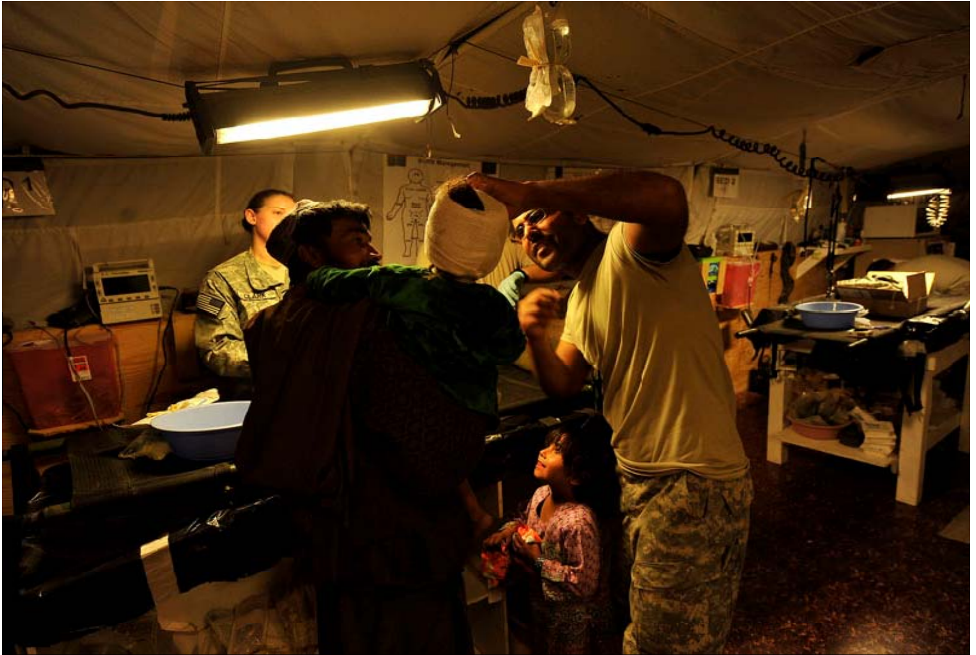
An Afghan girl receives medical treatment at the trauma aid station, Combat Outpost Rath, Afghanistan, Feb. 18, 2010. She was recently involved in an accident resulting in burns to the right side of her face and hand. (100218-F-0692M-222)