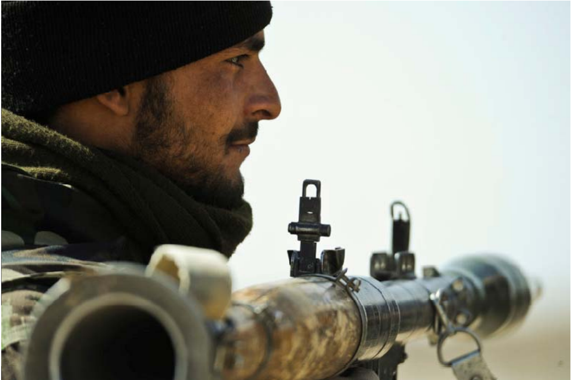
An Afghan National Army soldier provides security during a town meeting with village elders in Badula Qulp, Helmand province, Afghanistan, Feb. 16, 2010. Afghan National Army soldiers are supporting Operation Helmand Spider. (100216-F-9171L-408)