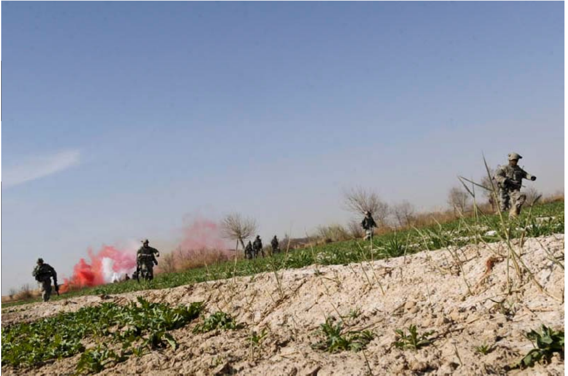
U.S. Soldiers with Alpha Company, 1st Battalion, 17th Infantry Regiment engage in a small arms fire fight with insurgents during Operation Helmand Spider in Badula Qulp, Helmand province, Afghanistan, Feb. 17, 2010. (100217-F-9171L-547)