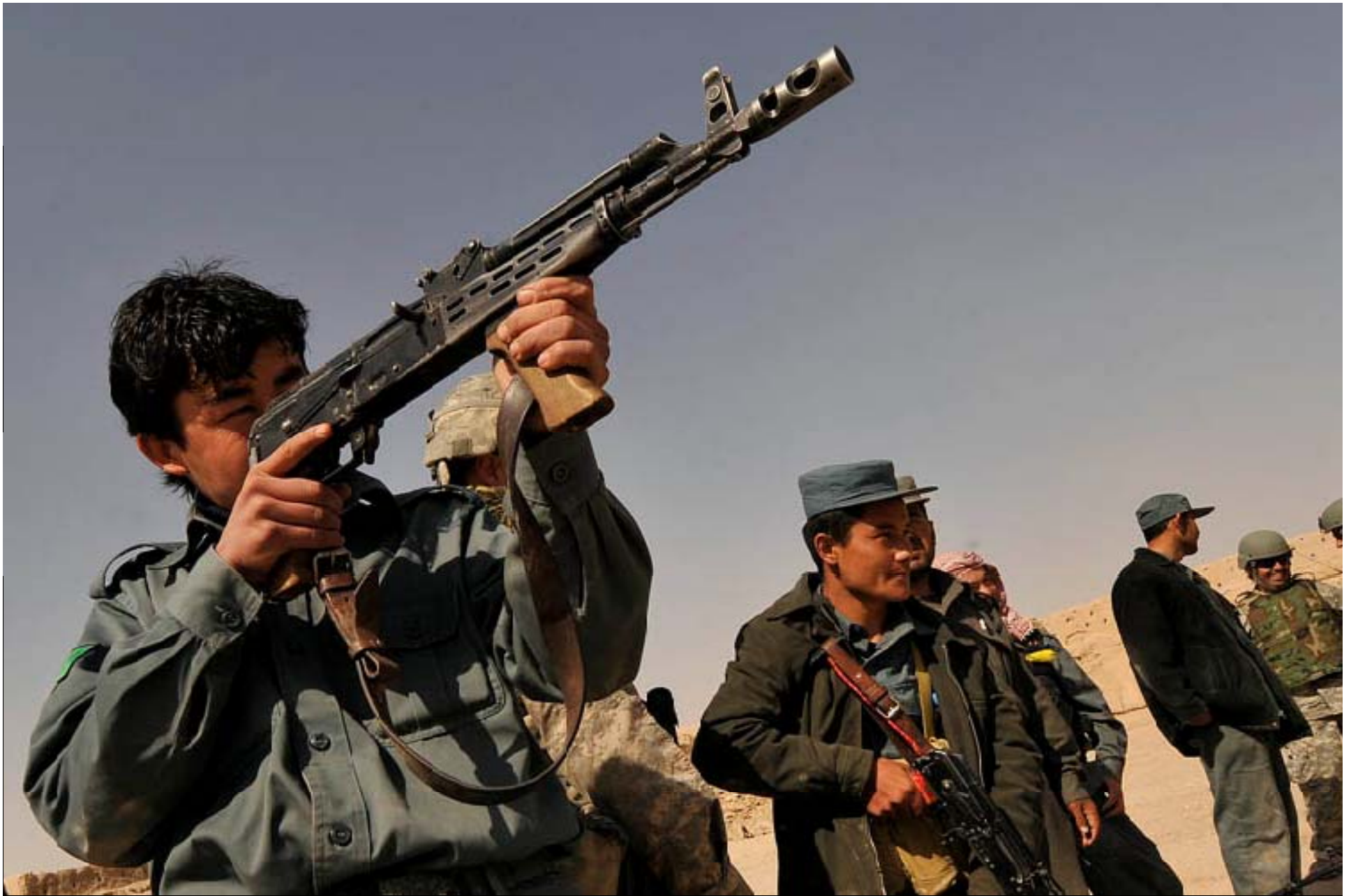
An Afghan National Policeman aims at his target during a live-fire exercise in Huta, Afghanistan, Feb. 14, 2010. (100214-F-0692M-132)