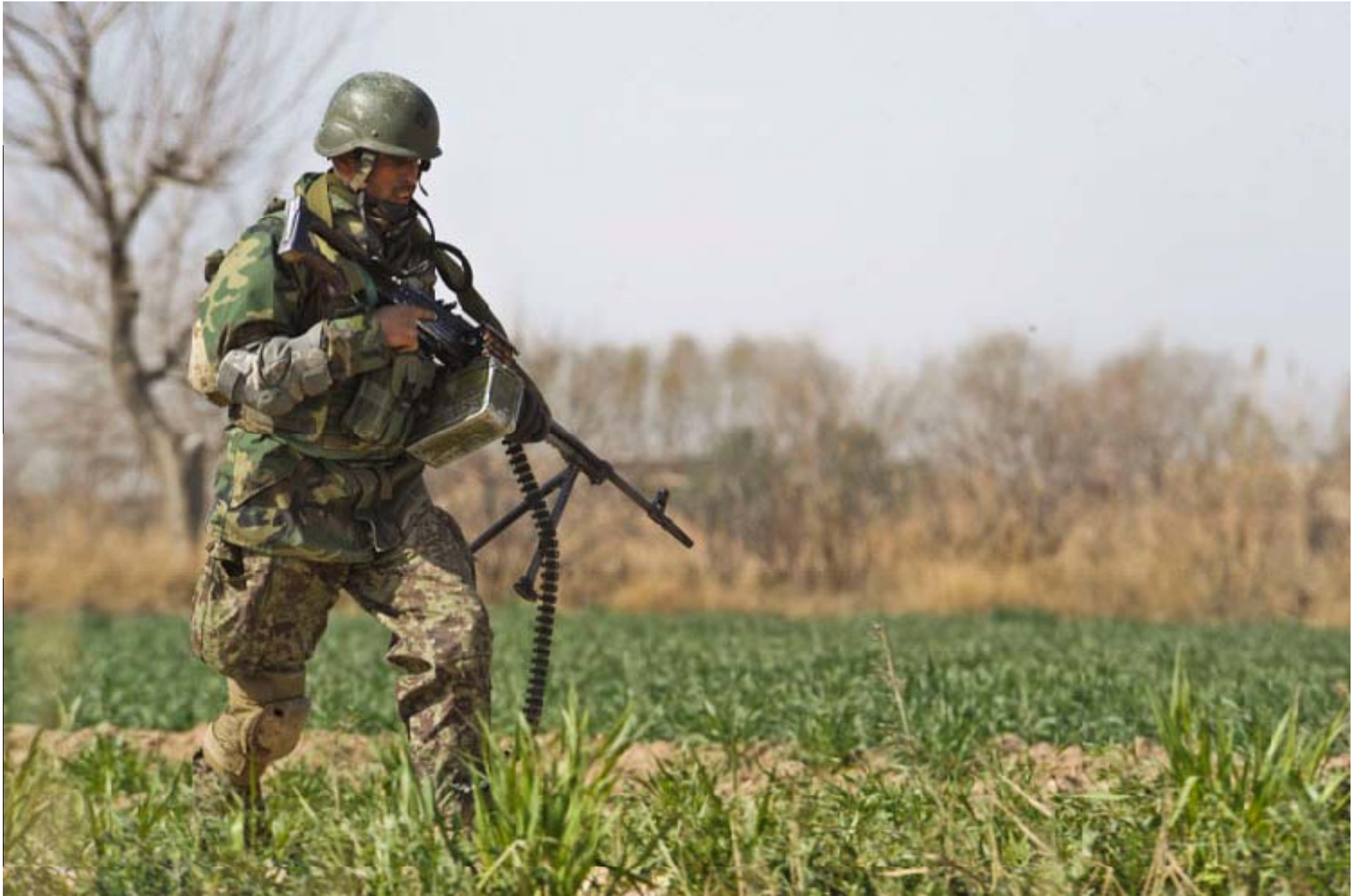
An Afghan National Army soldier engages in a small arms fire fight with insurgents during Operation Helmand Spider in Badula Qulp, Helmand province, Afghanistan, Feb. 17, 2010. (100217-F-9171L-580)