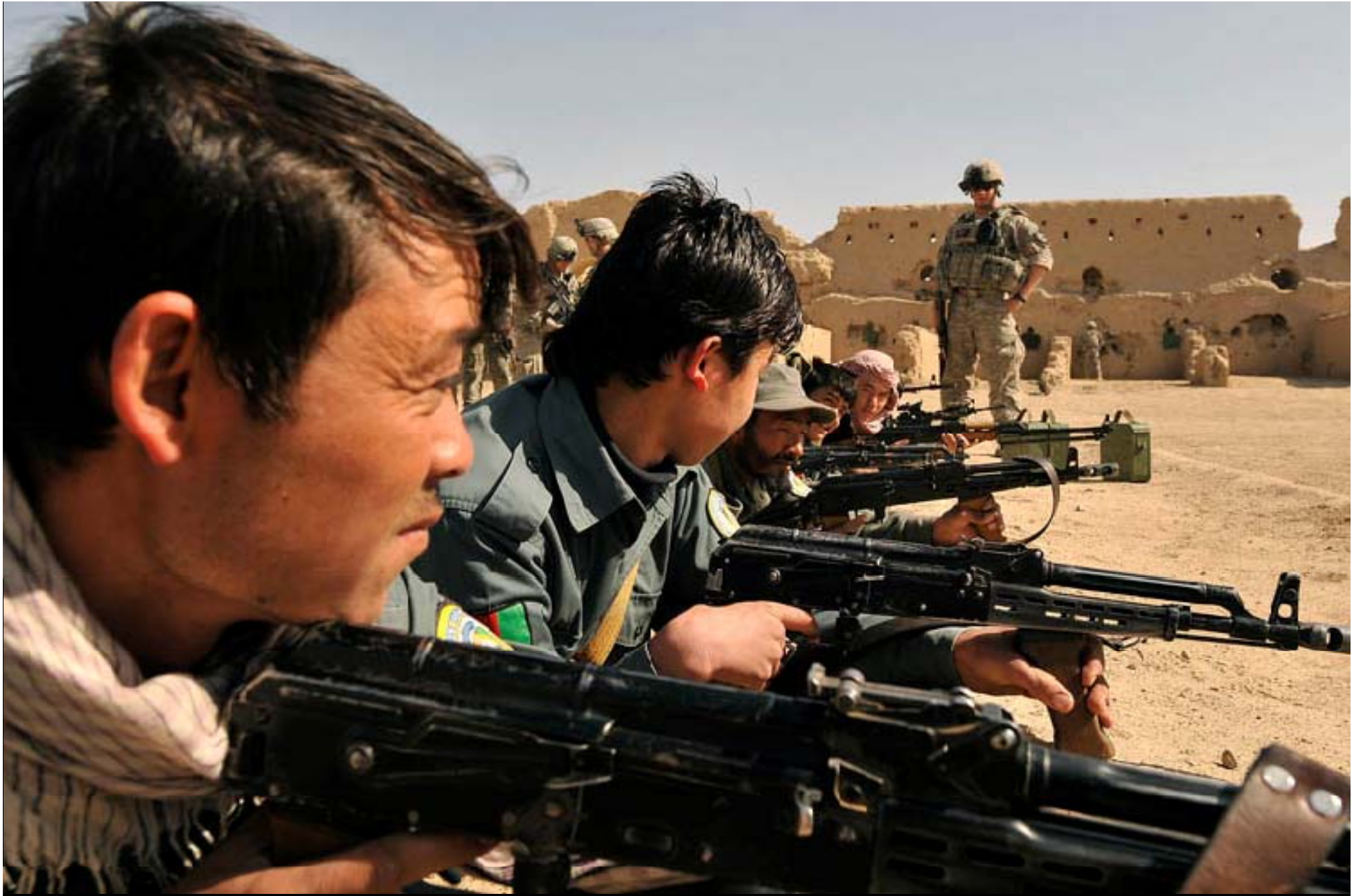
Afghan National Policemen attend a marksmanship training course led by U.S. Soldiers from 2nd Battalion, 1st Infantry Regiment in Hotal, Afghanistan, Feb. 14, 2010. (100214-F-0692M-025)