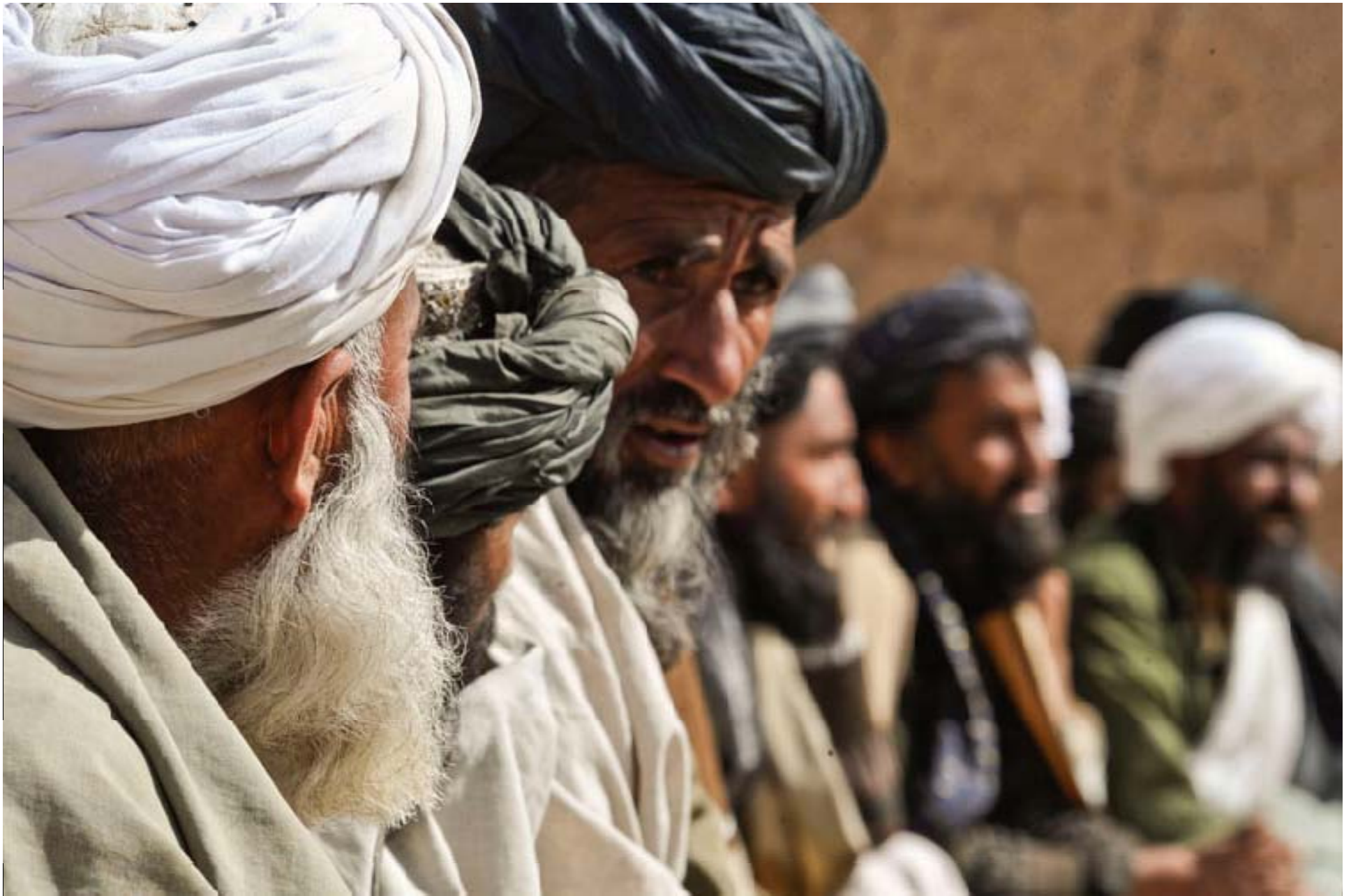
Afghan village elders attend a town meeting during Operation Helmand Spider in Badula Qulp, Helmand province, Afghanistan, Feb. 16, 2010. (100216-F-9171L-208)