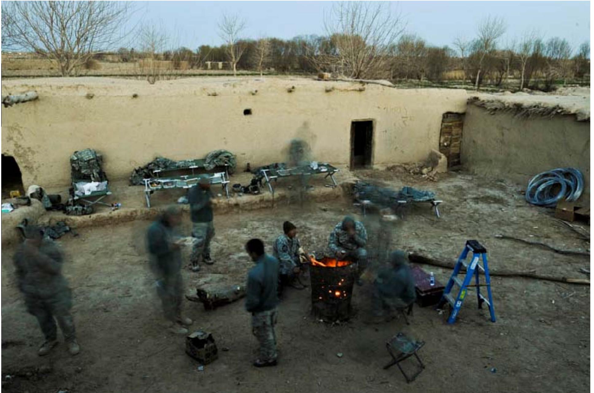
U.S. Soldiers from Alpha Company, 1st Battalion, 17th Infantry Regiment gather around the fire to eat dinner after completing a dismounted combat patrol during Operation Helmand Spider, Badula Qulp, Helmand province, Afghanistan, Feb. 13, 2010. (100213-F-9171L-033)