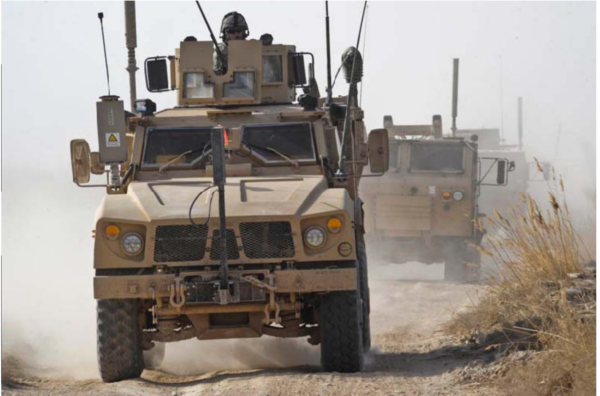
A U.S. Army mine-resistant, ambush-protected vehicle leads a convoy on a resupply mission during Operation Helmand Spider, Badula Qulp, Helmand province, Afghanistan, Feb. 15, 2010. (100215-F-9171L-043)